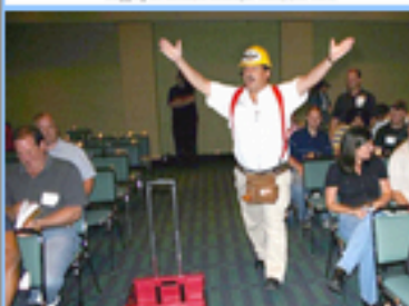
Videos - Speaker Idol Florida Finals - 2010